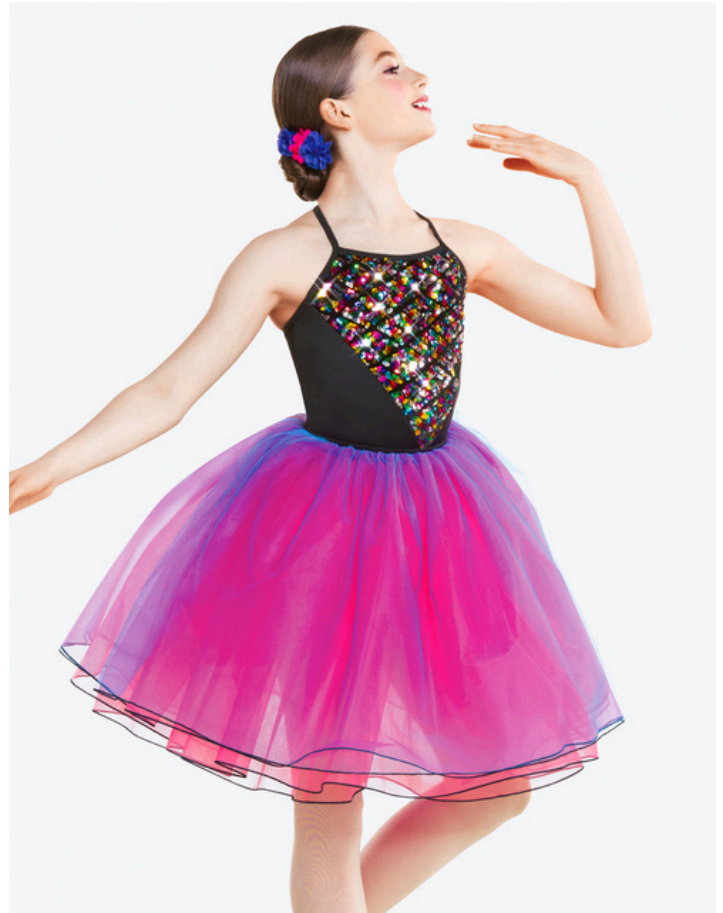
"The Rose Song" by Olivia Rodrigo