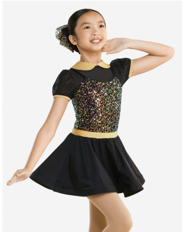
"Something Wild" by Lindsey Stirling & Andrew McMahon